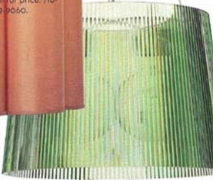
▲ Ferruccio Laviani's rippling polycarbonite Gè light for KARTELL comes in eight colors. $227. kartellus.com .