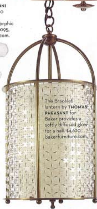
The Bracelet lantern by THOMAS PHEASANT for Baker provides a softly diffused glow for a hall. $4,620. bakerfurniture.com .