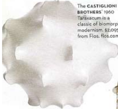
The CASTIGLIONI BROTHERS' 1960 Taraxacum is a classic of biomorphic modernism. $2,095. flos.com .