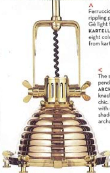
◀ The small Cargo pendant shows ARCHAEOLOGY's knack for machir chic. In polished l with copper ribb shade, $3,520. archaeology.com

"TAKE CARE WITH PENDANTS. THEY CAN LOWER A ROOM AND INTERFERE WITH VIEWS, BUT IN A LOFTY SPACE, PENDANTS ARE JUST RIGHT."