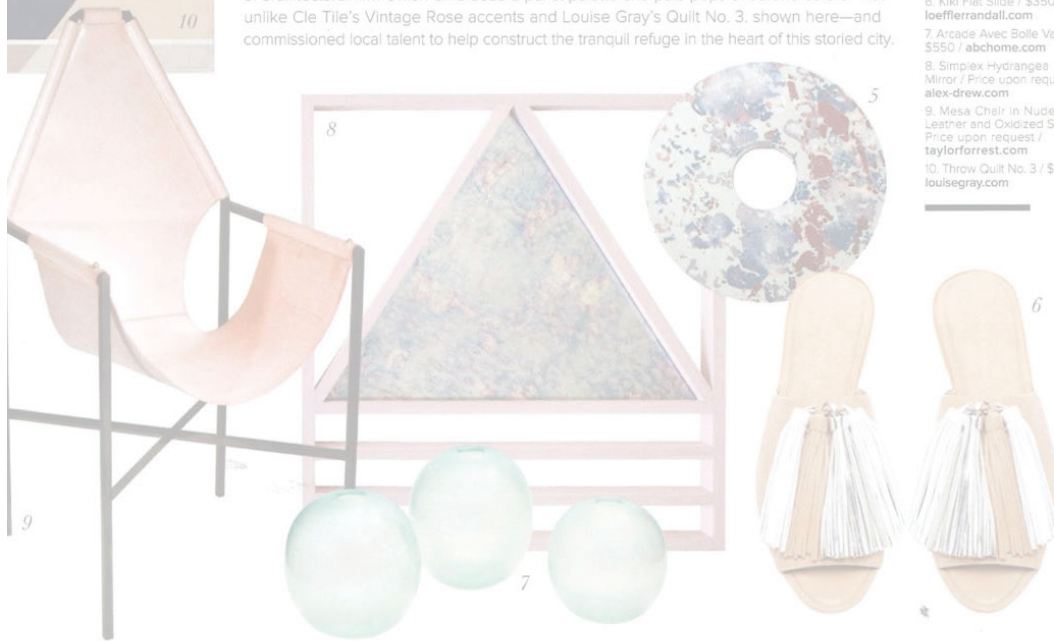
SALA AYUTTHAYA