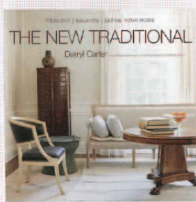
CARTER ADMINISTRATION My book shows how to give rooms character and make them warm, engaging and comfortable. THE NEW TRADITIONAL: REINVENT, BALANCE, DEFINE YOUR HOME, BY DARRYL CARTER; $45, AMAZON.COM