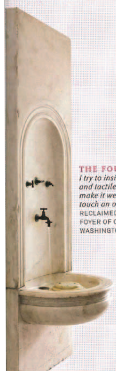
THE FOUNTAINHEAD I try to insinuate found architecture and tactile objects into a space to make it welcoming. If you can't touch an object, you can't use it. RECLAIMED FOUNTAIN, NOW IN THE FOYER OF CARTER'S TOWNHOUSE IN WASHINGTON, D.C.