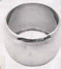
STERLING QUALIFICATIONS I like things simple, simple, simple. Unfortunately, simple can be the hardest thing to find on the planet! GEORG JENSEN ANTIQUE NAPKIN RING, STERLING SILVER, $300, JENSENSILVER.COM