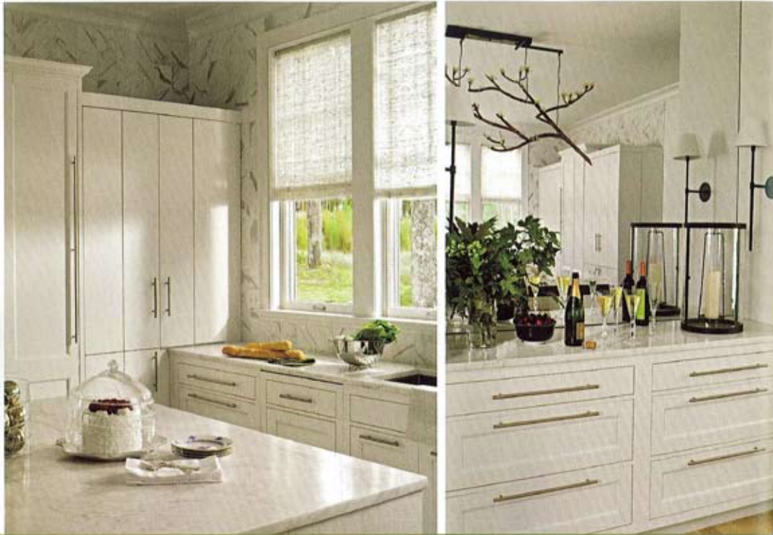
White cabinetry, marble tile on the walls, and a mirrored wall opposite the windows make the kitchen appear more expansive. A handcrafted light fixture modeled after a cherry blossom branch hangs above a table where guests can sit and have appetizers or cocktails while dinner is being prepared.