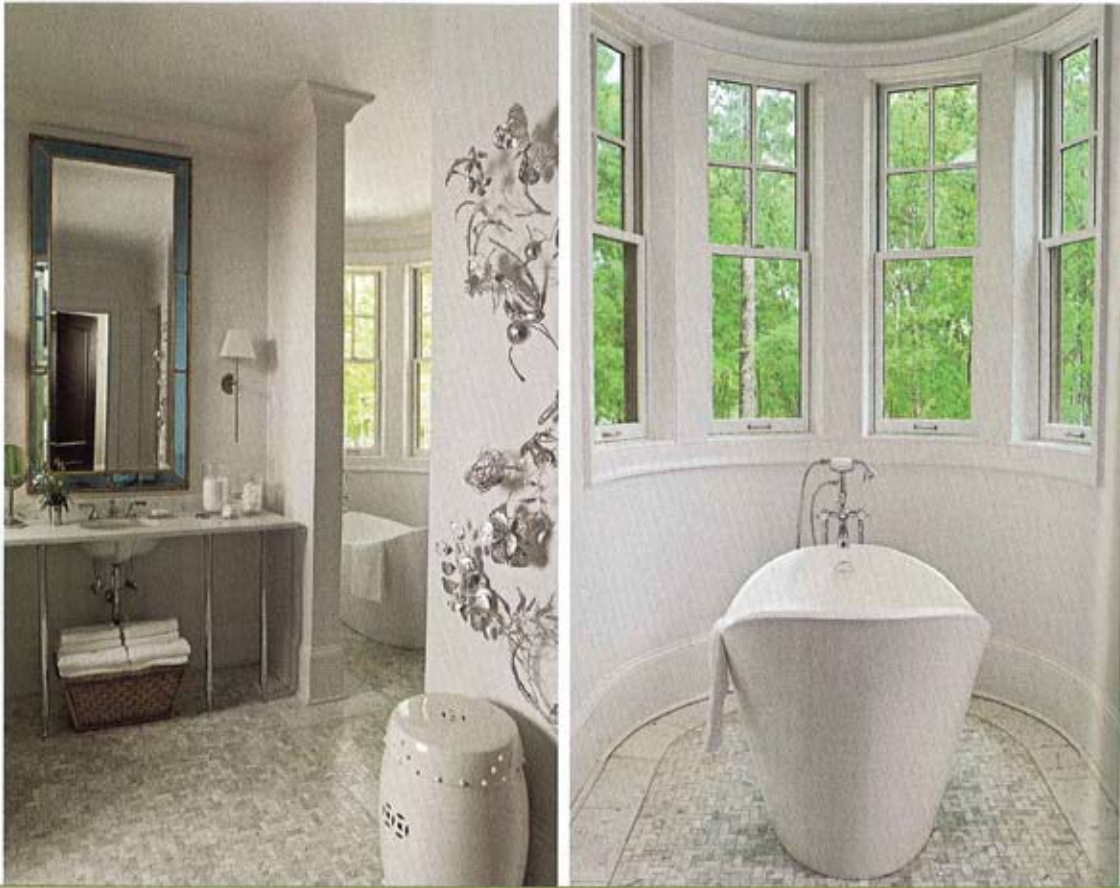
White marble tile and a white soaking tub give the bath a cloudlike effect. A nature-inspired metallic sculpture and tall mirrors framed with a hint of blue reflect the light coming in through the windows. "The sculpture is like jewelry on the wall," says the designer.