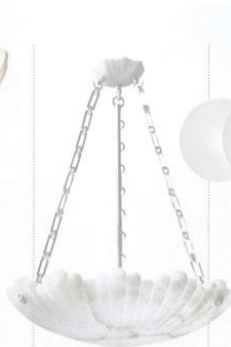
CHARLES EDWARDS Alabaster Dish 30. 36.25" h. x 23.75" dia.; charlesedwards.com