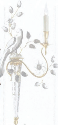
BAGUÉS PARIS Parrot sconce. 11" w. x 22" h.; price upon request. bagues-usa.com