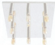
ARTERIORS Elrick flush mount. 4" h. x 20" sq.; $1,350. arteriors.com