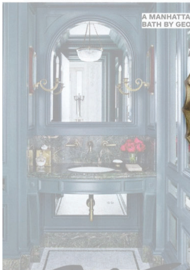
A MANHATTAN BATH BY GEORGIS.

“Flush mounts are best for low ceilings. To create a soft, warm glow, use a 300-watt halogen bulb.”