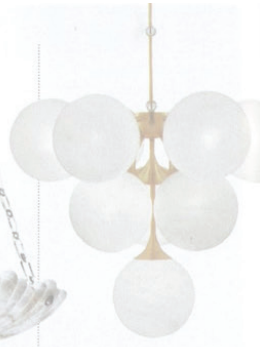
VISUAL COMFORT Cristol tiered pendant by Aerin. 28" w. x 23.25" h.; $1,680. circaighting.com