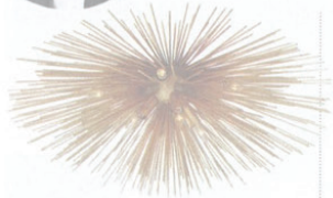
VISUAL COMFORT Strada light by Kelly Wearstler. 28" w. x 11" h.; $1,000. circaighting.com