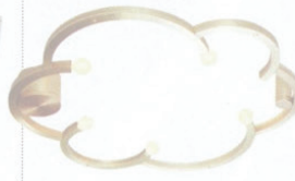
ROLL & HILL Blow ceiling mount. 34" l. x 32" w. x 4" h.; $11,000. rollandhill.com

“Flush mounts are best for low ceilings. To create a soft, warm glow, use a 300-watt halogen bulb.”