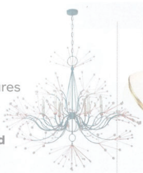
REMAINS LIGHTING Splashing Water 54 chandelier by Tony Duquette. 49" h. x 50" dia.; $9,895. remains.com