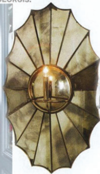
THE URBAN ELECTRIC CO. Parker sconce. 17.75" w. x 3.75" d. x 27.75" h.; from $3,344. urbanelectricco.com