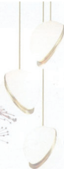
LEE BROOM Mini Crescent three-piece chandelier. 35.5" h. x 11.75" dia.; $2,975. leebroom.com