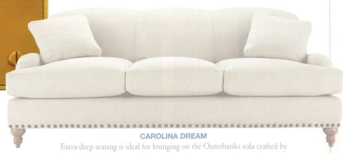
CAROLINA DREAM Extra-deep seating is ideal for lounging on the Outerbanks sofa crafted by Cleveland-based company Arhaus. Choose from custom colors or buy ready-stocked in this Lindy natural. $3,200, Danbury, 203-792-3702, arhaus.com.