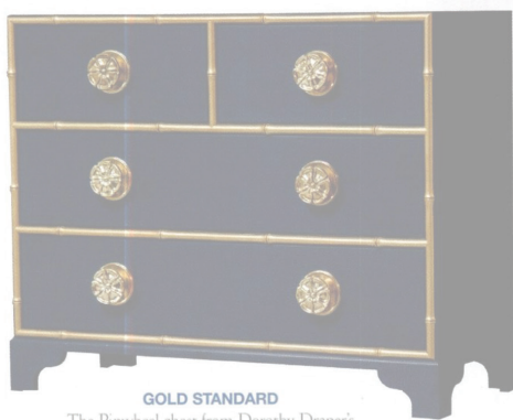
GOLD STANDARD The Pinwheel chest from Dorothy Draper's collection for Kindel features floral cast brass pulls and split-bamboo molding around each cherry drawer, crafted in Grand Rapids, Michigan. Price upon request (T), NYC, 646-293-6649, kindelfurniture.com .